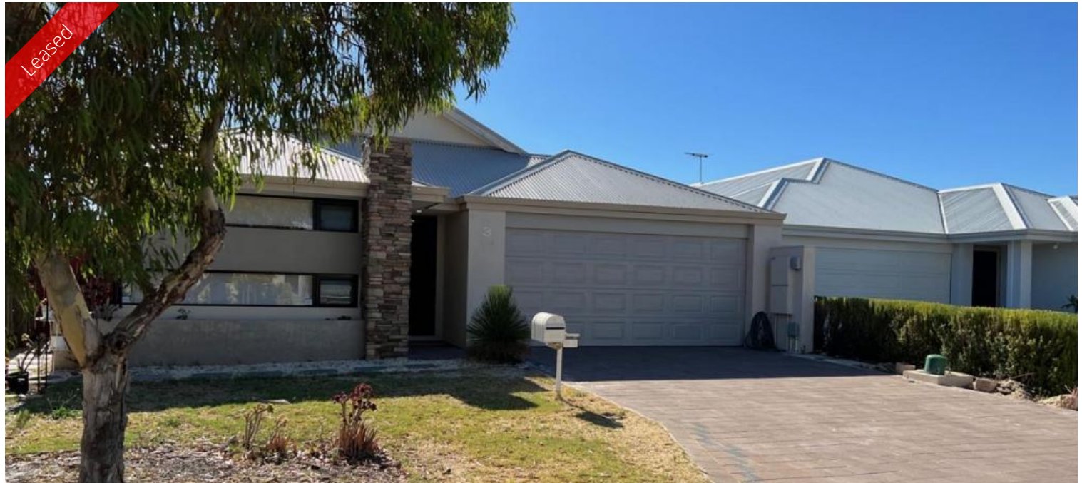
3 Bergala Dr, Ellenbrook