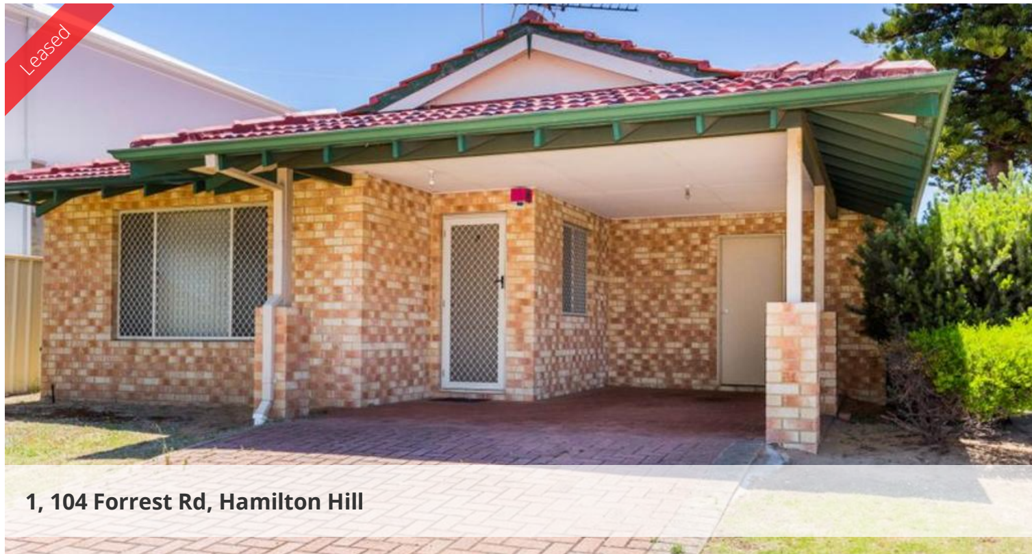
1, 104 Forrest Rd, Hamilton Hill