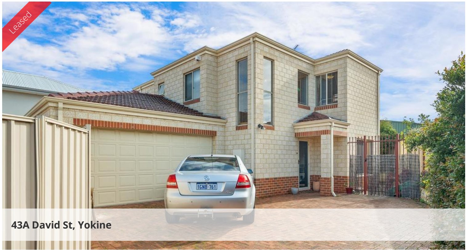
43A David St, Yokine